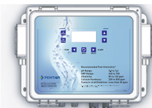
Figure 1. IntelliChem® Controller