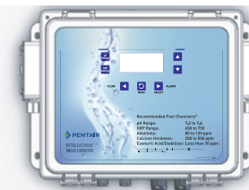
Figure 1. IntelliChem® Controller