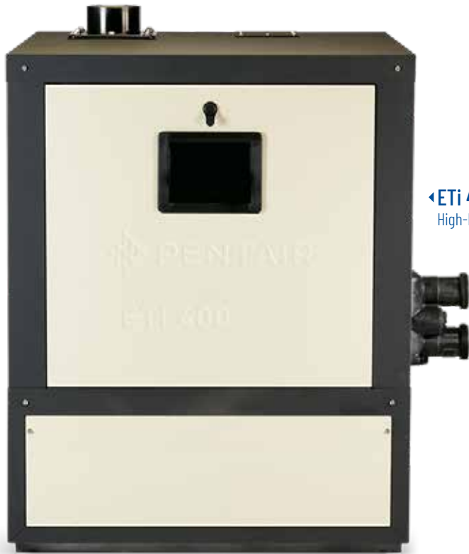
◀ ETi 400 High-Efficiency Heater