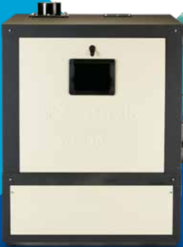
↑ ETi 400 High-Efficiency Heater