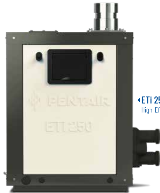
◀ ETi 250 High-Efficiency Heater