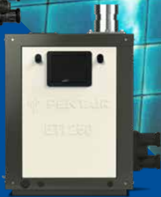
↑ ETi 250 High-Efficiency Heater